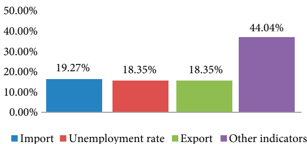
Fig. 2. Set of the macroeconomic factors correlating with the critical liquidity ratio

Hence, based on the findings of the correlation-regression analysis, the final list of the macroeconomic indicators was drawn, as provided in Table 4.